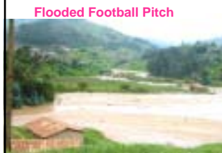
Flooded Football Pitch