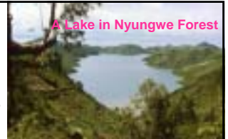
A Lake in Nyungwe Forest